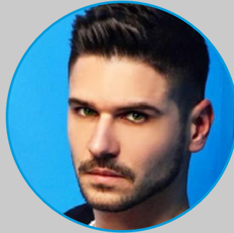
TOLGAHAN SAYIŞMAN also starred in: Never Let Go Tulip Age