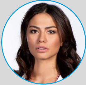
DEMET ÖZDEMİR Butterflies Kurt Seyt & Shura