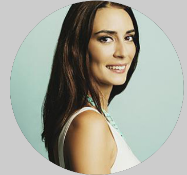
Melisa Sözen Magnificent Century