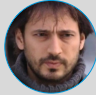
TİMUÇİN ESEN also starred in: Vıcdan, Thief & Police