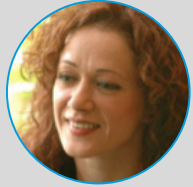
BENNU YILDIRIMLAR also starred in: Desperate Housewives, Falling Leaves