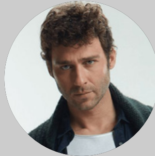
Seçkin Özdemir Bitter Love Love For Rent Magnificent Century