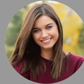
Afra Saraçoğlu Mrs. Fazilet and her Daughters