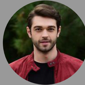
Furkan Andıç Meryem Sweet Revenge Orphan Flowers