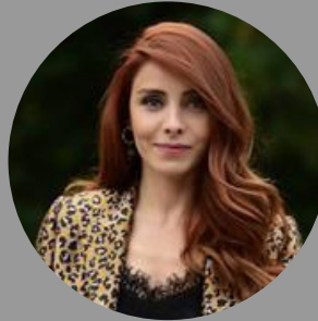
Nur Fettahoğlu Magnificent Century Forbidden Love